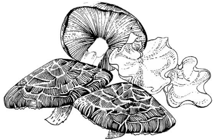
Lentinus edodes (Shiitake)

On a more practical note, the cool, damp spring is a perfect time for looking for cup-fungi (family Pezizales ), the discomycetes. They often grow on dead, rotting logs, sometimes under bark, in old stumps, but some of them are terrestrial. I wish you a sharp eye and “Good hunting!”