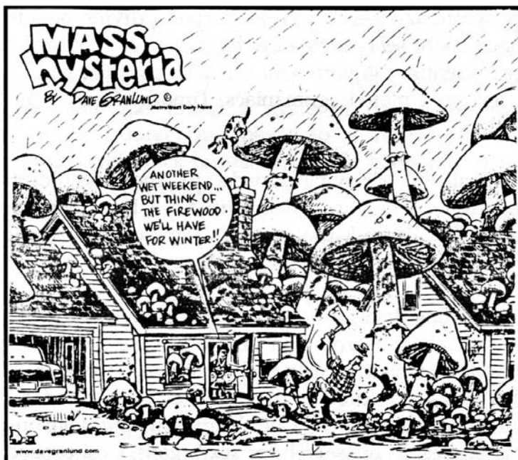
Reprinted, with permission, from the Metrowest Daily News for June 25, 2006, via the Boston Mycological Club Journal , v. 61-3